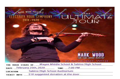
Electrify your symphony! Rock orchestra experience comes to