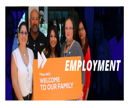
West-MEC searching for Adult Education Instructors